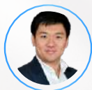
王冠 亚太区总经理 Exterro